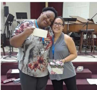
THANKS MR. BILL'S DONUTS!